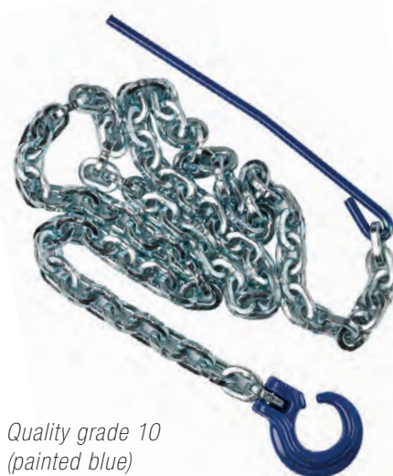
Quality grade 10 (painted blue)