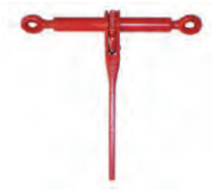
Ratchet tensioner with 2 eyelets, high-strength, QG 8