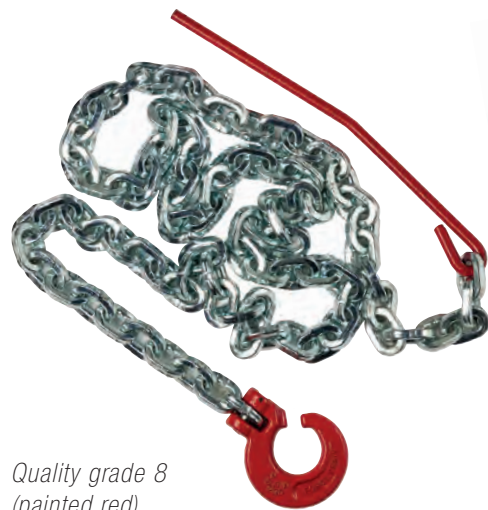
Quality grade 8 (painted red)