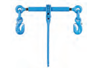
Ratchet tensioner with 2 clevis connectors, high-strength, QG 10