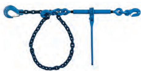
1-piece lashing chain, high-strength, permanently mounted spanner, QG 10