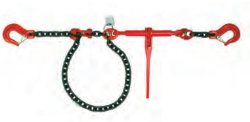
1-piece lashing chain, high-strength, permanently mounted spanner, QG 8