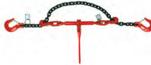
2-piece lashing chain, high-strength, spanner not permanently mounted, QG 8