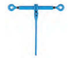
Ratchet tensioner with 2 eyelets, high-strength, QG 10