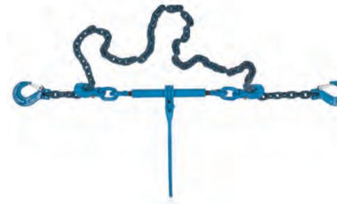
1-piece lashing chain, high-strength, permanently mounted spanner, QG 10