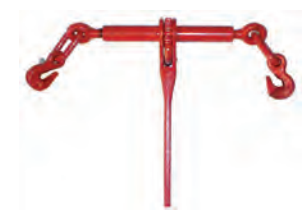
Ratchet tensioner with 2 shortening hooks, high-strength, QG 8